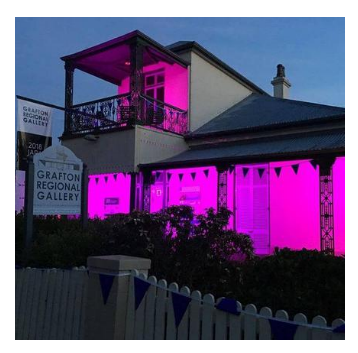
Valued at $13.4 million the Grafton Regional Gallery is a very valuable community asset. Its collection alone is worth over $3.5m.

Your kind contribution is valuable and appreciated.